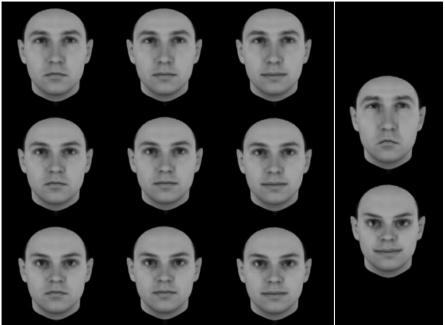
FIG. 3. Stimulus faces of Experiment 2. The four faces displaying the maximum feature variations (at the corners of the figure) as well as faces displaying “neutral” variations. The prototype “Bob” is the face at the top of the separated right column and the prototype “John” is the face at the bottom of this right column. The half-face conditions displayed only the upper or lower half of the stimulus face.

Stimuli. The stimuli were the same as in Experiment 1 with the following exceptions. (1) To decrease the distinctiveness-based salience of the variable mouth we increased the similarity of mouth Level 1 and 3 to Level 2 as can be seen in Fig. 3. The variations of the eyes remained the same as in Experiment 1. The stimulus faces of Experiment 2 consisted of nine new faces plus the corresponding six face halves. We expected that in decreasing the distinctiveness-based salience of the mouth we would increase the relative salience of the eyes and therefore increase children's sensitivity to the eyes variable. (2) To facilitate the identification of Bob and John in the familiarization phase we constructed new facial prototypes for Bob and John in which the features—mouth and eyes—were exaggerated (see the faces of the separated right column of Fig. 3). The prototypes were also shown on the pictures which were used by the participants to give their responses during the test phase, but they were not used as test stimuli. The test faces were the nine faces depicted in Fig. 3 plus the corresponding six