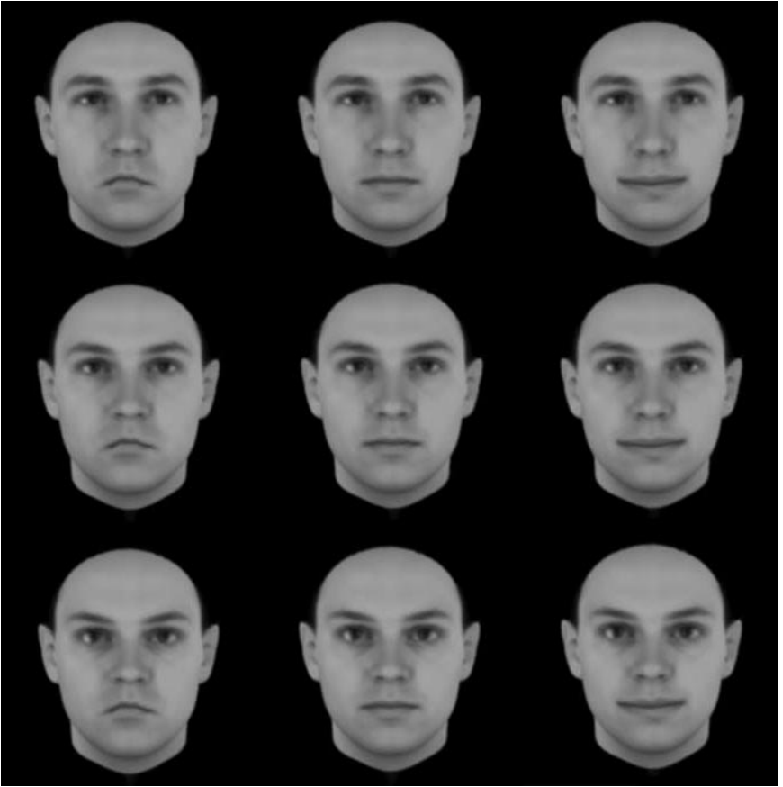
FIG. 1. Stimulus faces used in Experiment 1. The four faces displaying the maximum feature variations (at the corners of the figure) as well as faces displaying “neutral” variations (in the middle of the figure). The prototype “Bob” is the face at the left corner at the top and the prototype “John” is the face at the right corner at the bottom. The half-face conditions displayed only the upper or lower half of the stimulus face. The reader can cover half of the face to experience these conditions.

relative degree of support for each of the test alternatives. In the two-alternative choice task, the probability of a Bob choice, P(B) , is equal to