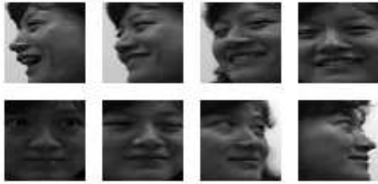
Figure 2. Few cropped faces from a video sequence in the UCSD/Honda dataset.

and expression variations and varying illumination as is evident from Figures 1 and 2.