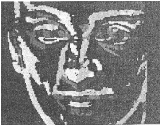
Fig. 4 Gradient image of face showing gradient strength and direction