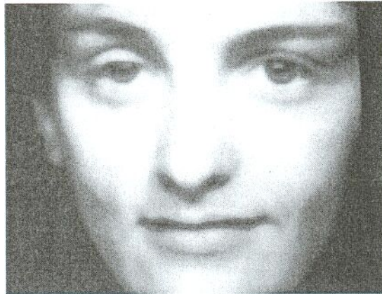
Fig. 3 Original image of face